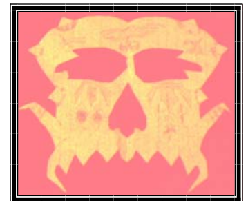
Mask Made by Zerby Gap Boy