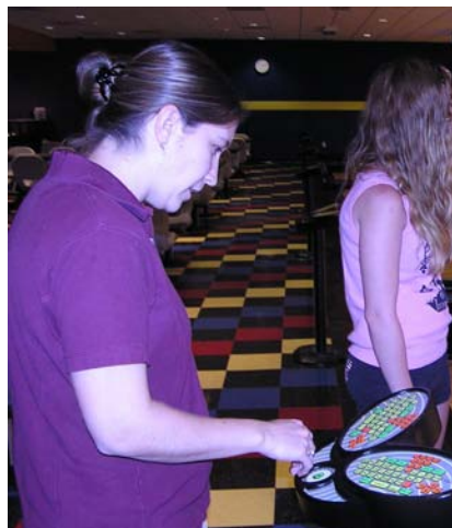
Youth enrolled in Big Brothers Big Sisters of Centre County and JUMP went bowling recently in Philipsburg.

Read more about the JUMP program in Philipsburg on the last page of the newsletter!